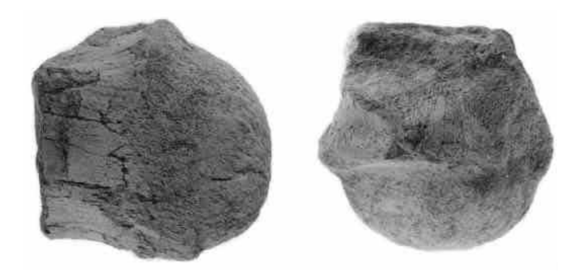
Figure 2. Titanosaurid caudal vertebrae (IGM 6080-2), from Chihuahua, Mexico. Right, lateral view; left, dorsal view. Scale x 0.91.